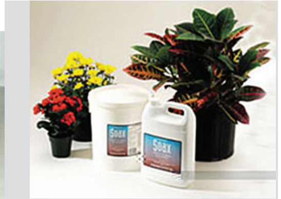
Soax ® dry and wet product containers

Soax ® wetting agent helps to achieve consistency in growing media by aiding in the even dispersing of water and nutrients throughout the entire root zone. As a result, it helps prevent water masses from forming and helps to reduce the occurrence of spot drying. Soax ® wetting agent helps to ensure air-to-water ratios are uniform throughout the entire root zone and helps increase the available feeding sites for plant roots. Soax ® helps to improve consistency, quality and efficiency of commercial growing media during crop production and beyond. In addition, Soax ® helps the growing materials, such as peat moss, to overcome the resistance to the initial wetting. To create the best possible environment for all plant roots, growers can choose from liquid and/or granular options of the Soax ® wetting agent.