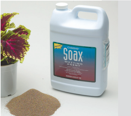
Soax ® container and granules

OASIS ® Grower Solutions Wetting Agent Supports growing media with efficient moisture management