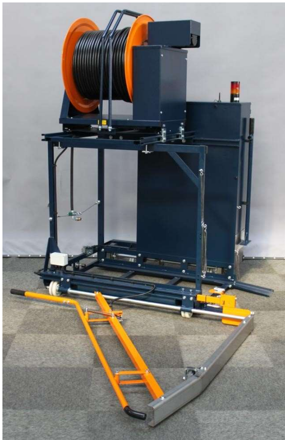
The Berg Hortimotive Meto transportation cart is expressly designed for the purpose of Meto spray unit movement.

The Meto Transportation cart is especially designed for Meto spray unit path to path movement. Use our transportation cart in combination with the Meto spray robot and there is no need to be present in the greenhouse. Spraying of crops can, namely, be executed in an automatic capacity.